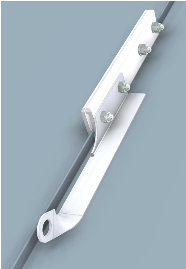
Figure 1: Anchor device type: LUX-top® SDA-Falz

The device is fixed to double-skin partition roofs (Figure 1) by four bolts (M10 x 33) by means of the aluminium folded clamping rail directly on the standing seam of the roof. The user can protect himself from falling by attaching his personal protection equipment to the angled mounting lug. The anchor device consists of corrosion-resistant material.